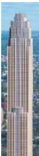
Wells Fargo Center